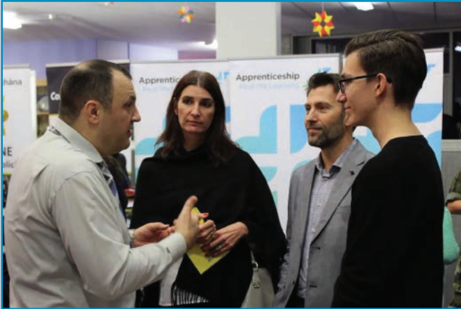
Discussions at the "Life after the Leaving Cert" event

On Thursday 19th of October 2017, Athlone Community College launched a brand new event- 'Life after the Leaving Cert'. All senior students across the Longford Westmeath Education Training Board were invited to attend this event along with their parents and siblings. Students had the opportunity to discuss their career options with people who work in their areas of interest. It was great to see so many outstanding companies and organisations giving up their free time in order to inspire our students. Local companies Eriksson, Medtronic, Abbot, Tormey Solicitors and RBK Accountancy had stands and provided the students with great insights into their working life and the sorts of roles that exist within their respective companies. Other organisations, Barnados and Foróige were on hand to provide information on careers in social care. Over the course of the evening, presentations took place to explain the intricacies of each company/career e.g. Architecture, MRI Specialist, Biomedical Science and careers in the Arts. Public organisations and initiatives such as the Gardaí, the Defense