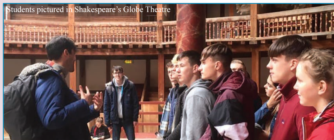
Students pictured in Shakespeare's Globe Theatre