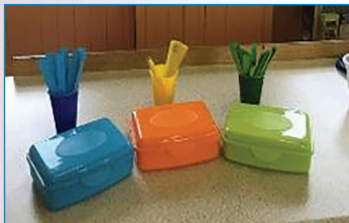
The 3 happy days project

Ballymahon Youthreach have had numerous beneficial staff training days so far this year including first aid, manual handling, SPHE, SafeTalk, suicide awareness, Outlook 365 and health and safety - all of which will make a huge difference to the centre. The students have also benefitted from World Mental Health Day. In the centre students were encouraged to participate in a "3 happy days" project where they were asked to write down one positive thing that happened that day or to think of something that makes them happy in general. It was a great success and well done to all students who were positive towards the activity.