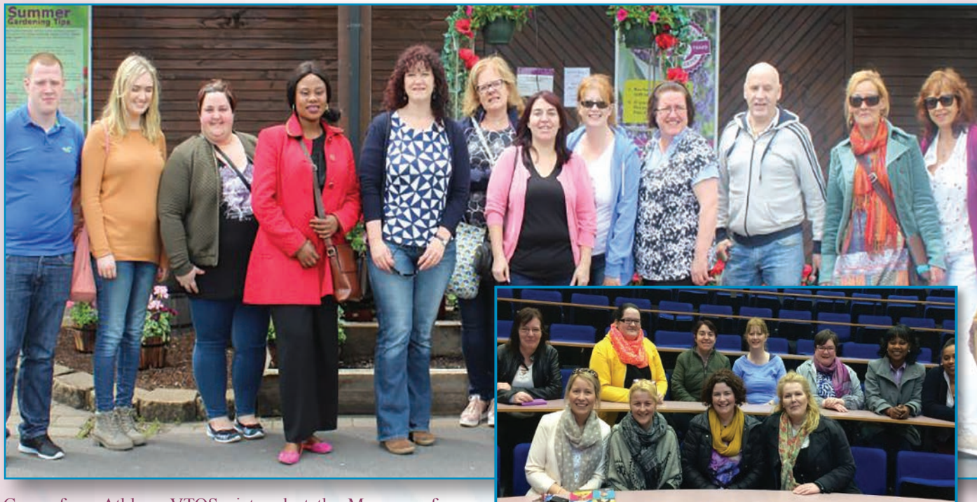
Group from Athlone VTOS pictured at the Museum of Country Living